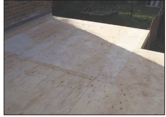
New plywood deck fitted