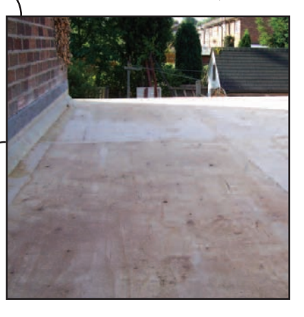
5 Lay Glassfibre,