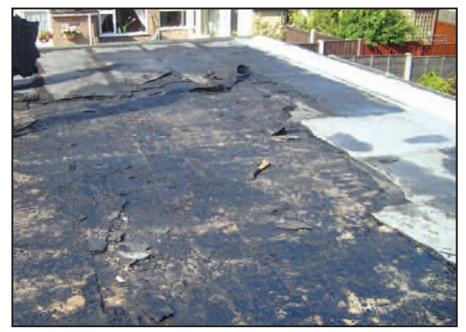
Before AFM Roof

If AFM Roof is not suitable for your project, we have plenty more products you can choose from. Visit our website www.fibreglassmouldings.co.uk for more information.