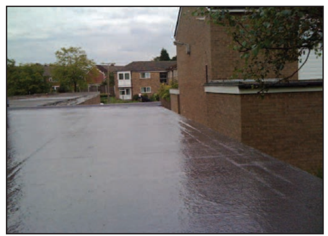
After AFM Roof