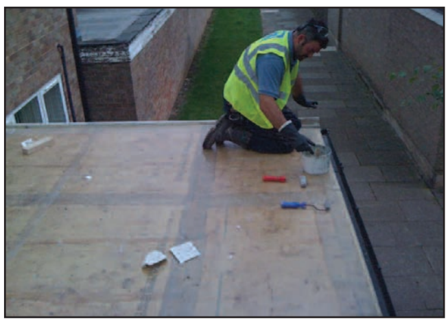
AFM Roof resins applied