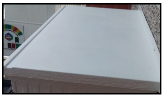
With water retention with outlet for rain water